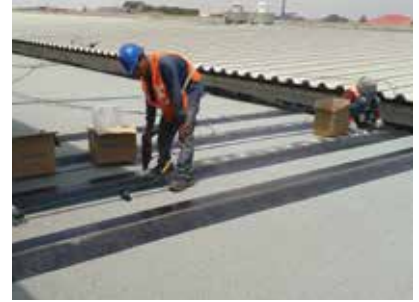
DuO Mecano installation on existing roof