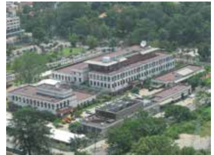
DuO Mecano reference project