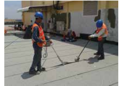
Welding of overlaps