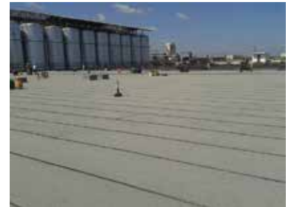
Asia breweries Inc. DuO Mecano renovation reference